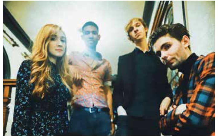
The Harriets - Full band

bloggers, DJs and critics. His DIY approach to his developing 'British Pop' sound is individual and characterful while, live, he combines instrumental skills with a natural gift for storytelling.