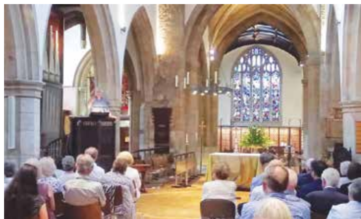
Tom Holland on “Athelstan and the making of England” in the inaugural lecture series

These new developments will complement an already full heritage, learning and community programme which includes: