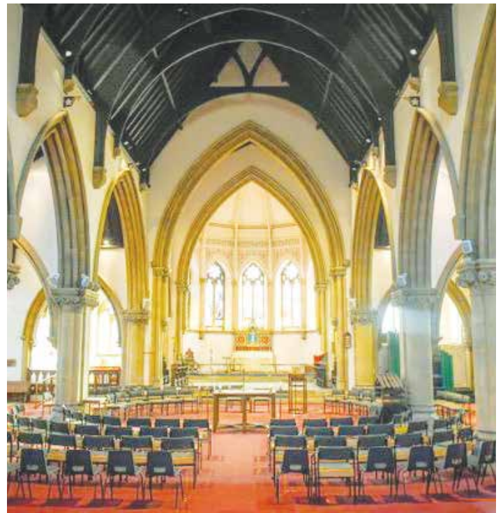
St John's interior, after completion of phase 1 work ("Before", see below)

It's been a long and sometimes bumpy journey to get this far: a test of belief, patience and perseverance that has brought us closer together as a church and community.