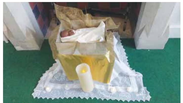
“diddi disciples” (epiphany season focus)

We have recently introduced Diddi Disciples for our younger children on Sunday mornings at St John’s. This is church especially for little ones with the focus on worship and storytelling rather than on teaching. There is lots of interaction, movement and singing to engage and nurture children’s spirituality. It’s during our 10am service. Under 3’s need to be accompanied by an adult. Children aged 7 and above have their own “children’s church” activities.