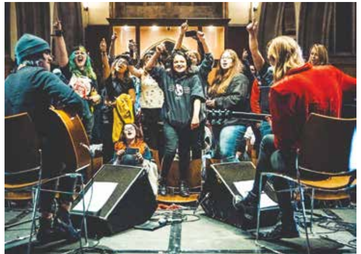
As it is.

The first ever K-Pop UK National Competition was held last year and the organisers chose All Saints Church for their venue.