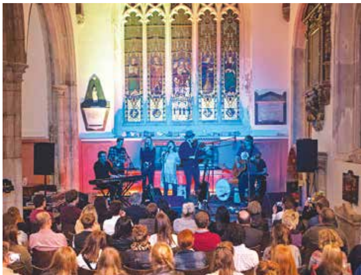
Gabrielle Aplin.

Over the last five years Banquet Records have added All Saints to their list of Kingston venues finding that the building provides “a beautiful setting and wonderful environment for those who make beautiful music ... we're so grateful to the church for trusting us and enabling us to provide a safe environment for people of all ages, but particularly youngsters in and around Kingston.”